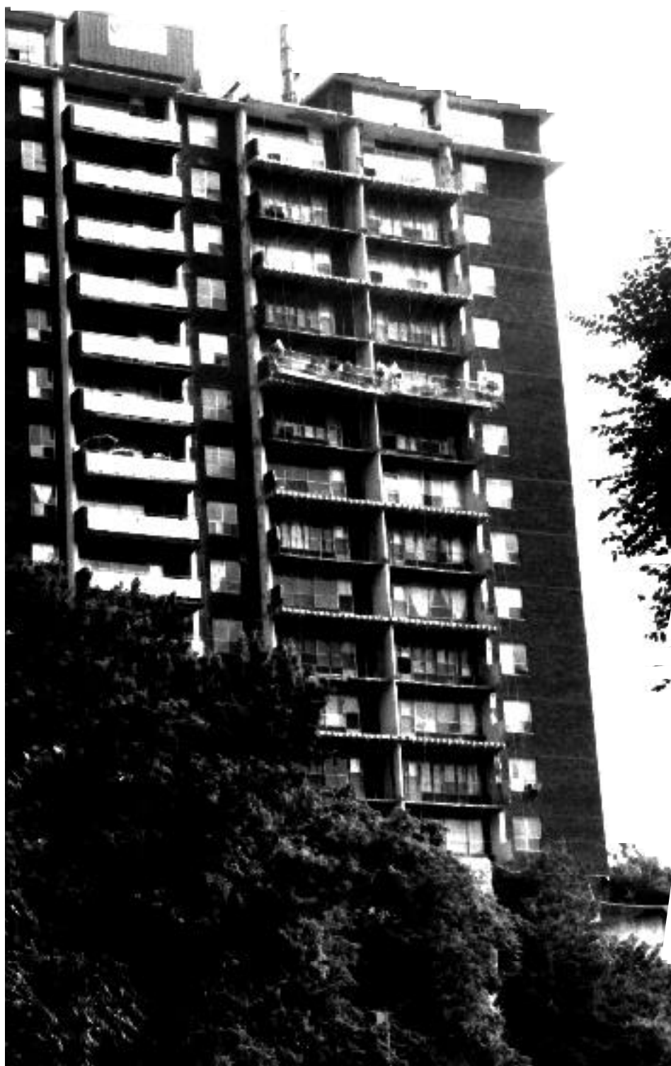
Proposed rent control changes are unlikely to produce much new construction.

Phone: (416) 340-7818 Fax: (416) 979-9159